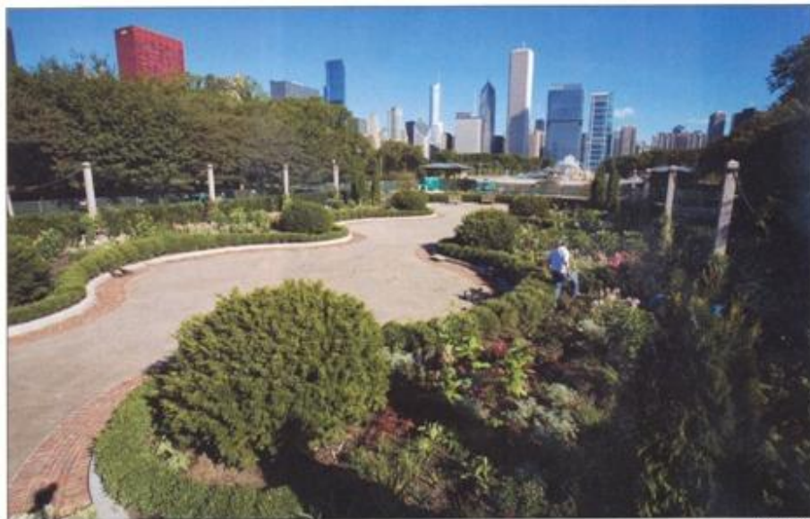
STEPHEN J. SERVO

We were very impressed with an idea that the landscape architects came up with: They have placed a 5-foot circle of pink granite in the center of the garden with Roman